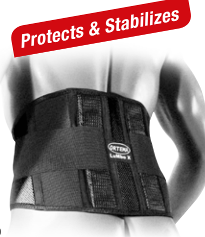
Version "High" (Height at the back 24 cm)

Low - 16 cm 1 pc. € 54.90 High - 24 cm 1 pc. € 59.90